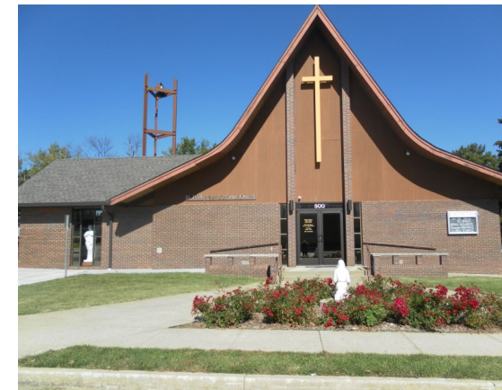
St. Philip Neri Church 514 Parker Ave, Osawatomie, KS 66064 https://www.miamilinn Catholics.org/SPN