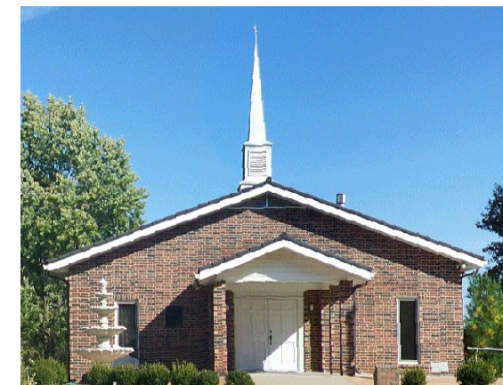
Our Lady of Lourdes Church 819 N 5th St, LaCygne, KS 66040 https://www.miamilinn Catholics.org/OLL