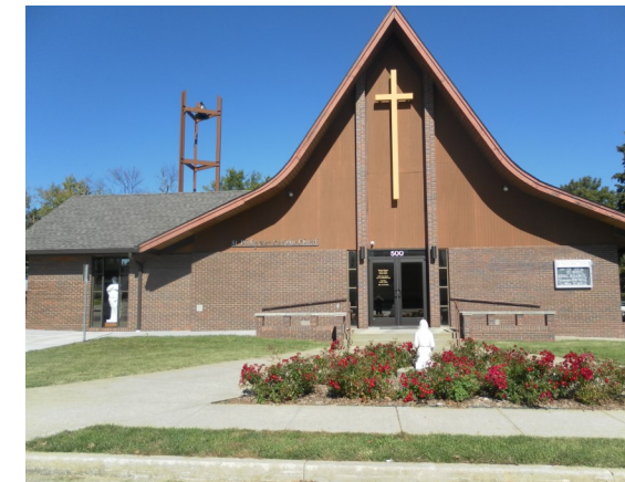
St. Philip Neri Church 514 Parker Ave, Osawatomie, KS 66064 https://www.miamilinn Catholics.org/SPN

Twenty First Sunday in Ordinary Time August 25, 2019