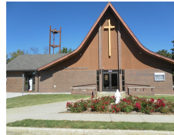
St. Philip Neri Church 514 Parker Ave, Osawatomie, KS 66064 https://www.miamilinn Catholics.org/SPN