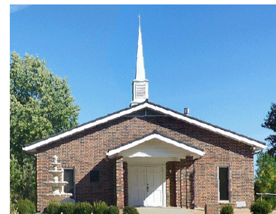
Our Lady of Lourdes Church 819 N 5th St, LaCygne, KS 66040 https://www.miamilinn Catholics.org/OLL