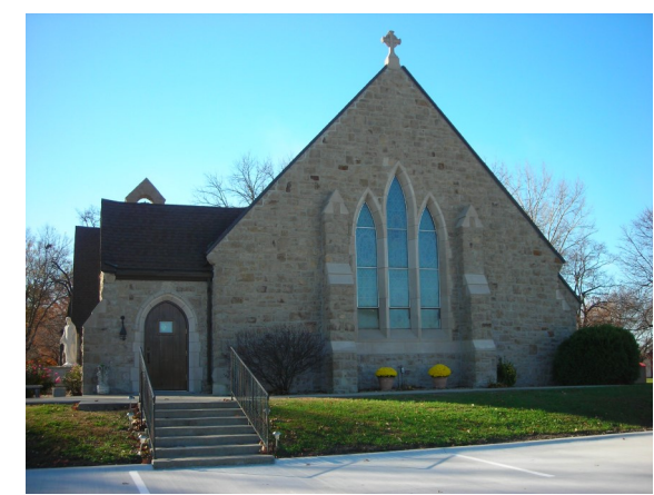
Sacred Heart Church (St. Rose Philippine Duchesne Shrine) 729 W Main St, Mound City, KS 66056 https://www.miamilinn Catholics.org/SH