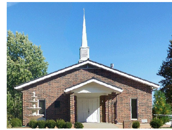
Our Lady of Lourdes Church 819 N 5th St, LaCygne, KS 66040 https://www.miamilinn Catholics.org/OLL