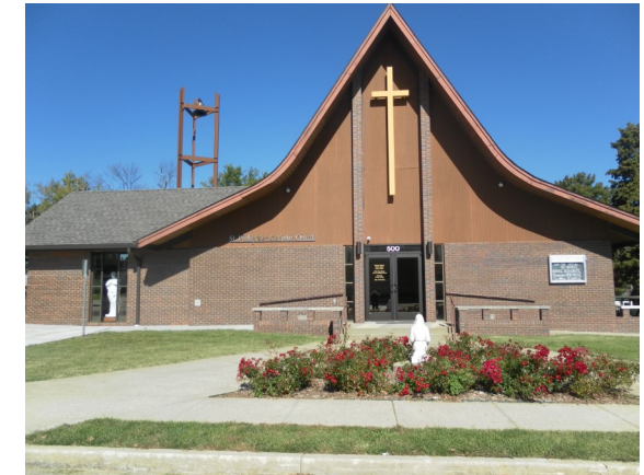
St. Philip Neri Church 514 Parker Ave, Osawatomie, KS 66064 https://www.miamilinn Catholics.org/SPN