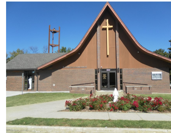
St. Philip Neri Church 514 Parker Ave, Osawatอมie, KS 66064 https://www.miamilinn Catholics.org/SPN