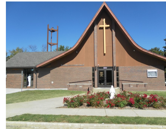
St. Philip Neri Church 514 Parker Ave, Osawatomie, KS 66064 https://www.miamilinn Catholics.org/SPN