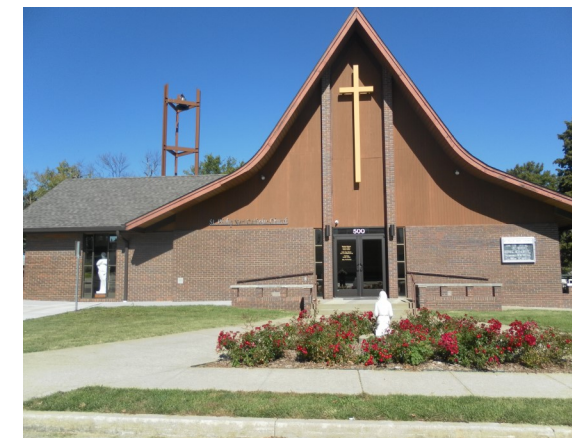
St. Philip Neri Church 514 Parker Ave, Osawatomie, KS 66064 https://www.miamilinn Catholics.org/SPN

Thirty-fourth Sunday in Ordinary Time November 24, 2019