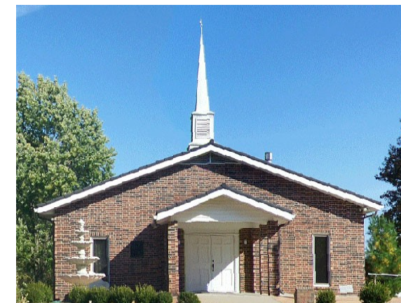
Our Lady of Lourdes Church 819 N 5th St, LaCygne, KS 66040 https://www.miamilinn Catholics.org/OLL