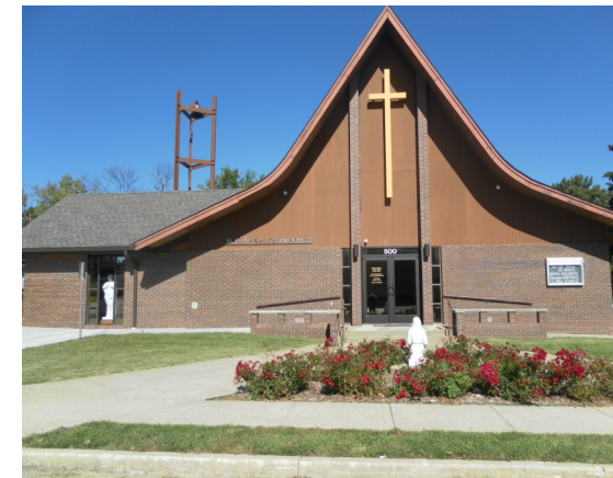
St. Philip Neri Church 514 Parker Ave, Osawatomie, KS 66064 https://www.miamilinn Catholics.org/SPN