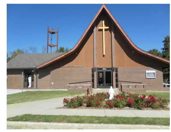
St. Philip Neri Church 514 Parker Ave, Osawatomie, KS 66064 https://www.miamilinn Catholics.org/SPN