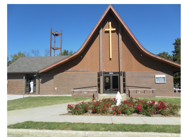
St. Philip Neri Church 514 Parker Ave, Osawatomie, KS 66064 https://www.miamilinn Catholics.org/SPN