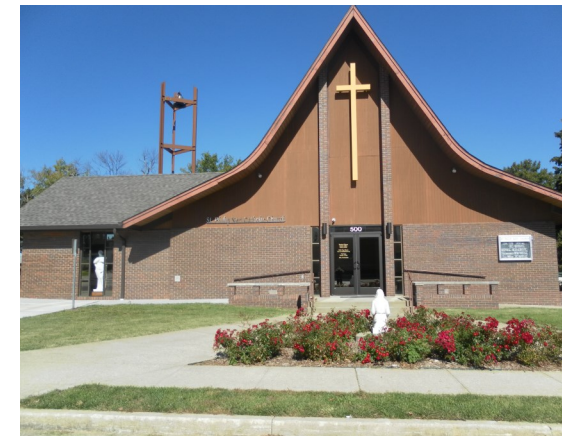
St. Philip Neri Church 514 Parker Ave, Osawatome, KS 66064 https://www.miamilinn Catholics.org/SPN