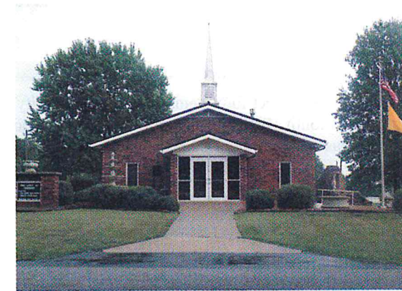
Our Lady of Lourdes Church 819 N 5th St, LaCygne, KS 66040 www.miamilinn Catholics.org/OLL