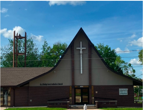
St. Philip Neri Church 514 Parker Ave, Osawatomie, KS 66064 https://www.miamilinnccatholics.org/SPN

19th Sunday in Ordinary Time August 10th, 2025