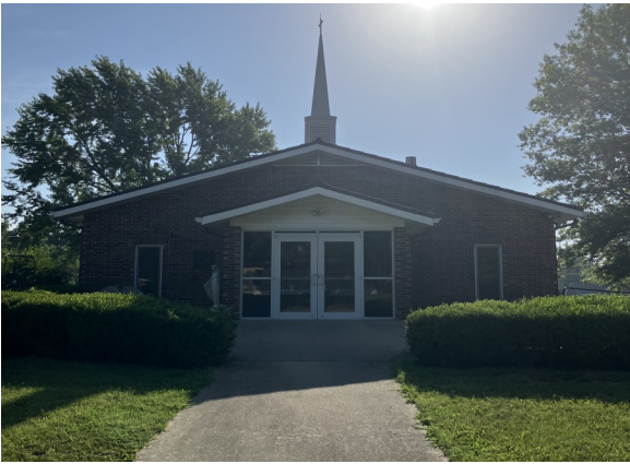
Our Lady of Lourdes Church 819 N 5th St, LaCygne, KS 66040 https://www.miamilinnccatholics.org/OLL