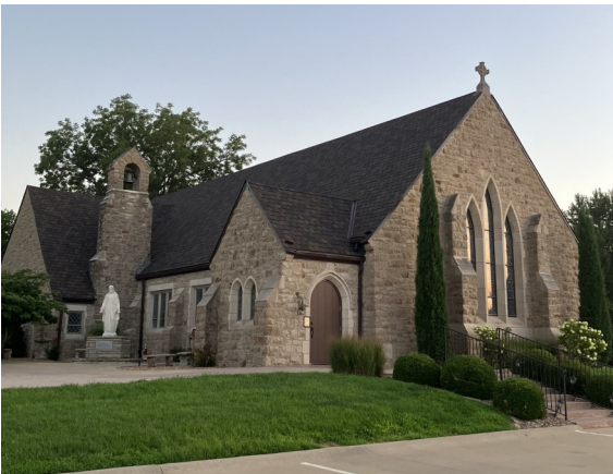
Sacred Heart Church (St. Rose Philippine Duchesne Shrine) 729 W Main St, Mound City, KS 66056 https://www.miamilinnccatholics.org/SH