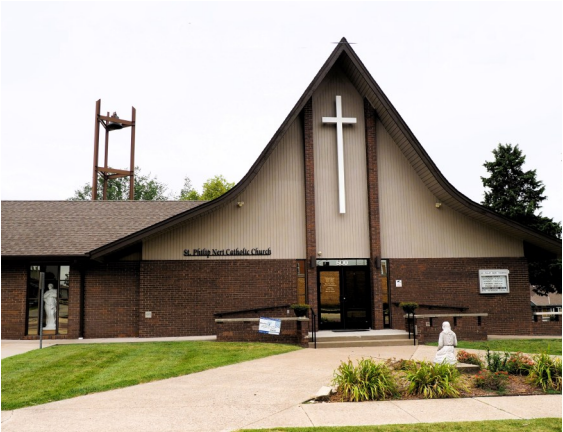
St. Philip Neri Church 514 Parker Ave, Osawatomie, KS 66064 https://www.miamilinnccatholics.org/SPN