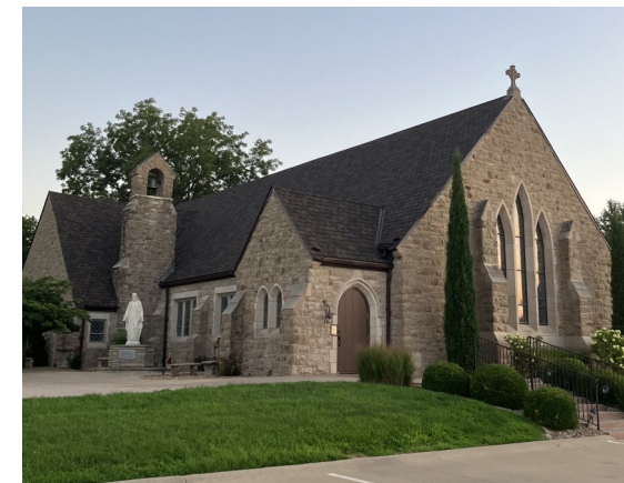
Sacred Heart Church (St. Rose Philippine Duchesne Shrine) 729 W Main St, Mound City, KS 66056 https://www.miamilinn Catholics.org/SH