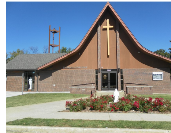
St. Philip Neri Church 514 Parker Ave, Osawatome, KS 66064 https://www.miamilinn Catholics.org/SPN