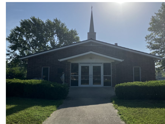
Our Lady of Lourdes Church 819 N 5th St, LaCygne, KS 66040 https://www.miamilinn Catholics.org/OLL