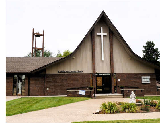
St. Philip Neri Church 514 Parker Ave, Osawatomie, KS 66064 https://www.miamilinn Catholics.org/SPN